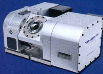
5TH AXIS ROTARY TABLES