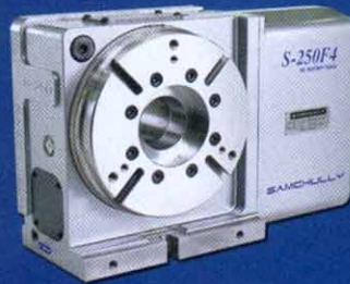
4TH AXIS ROTARY TABLES