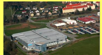
SANDVIK Tooling Supply Schmalkalden: state-of-the-art manufacturing facility on 13,000 m 2 of space.

Contact: Manali Inamdar Email: inamdar@zoller-in.com PH: +91 2027496118 www.zoller-in.com