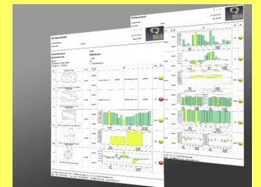
Clear and complete documentation of the measured results in accordance with DIN 3968.