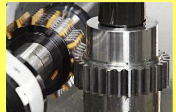
Started in 2012, SANDVIK Coromant offers solutions for form milling cutters.