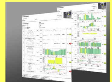
Clear and complete documentation of the measured results in accordance with DIN 3968.