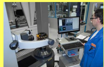
ZOLLER »hobCheck 800« in Quality Control at SANDVIK Tooling Supply Schmalkalden.