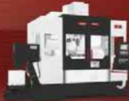
MF630 MF630U Full 5-Axis