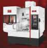
MF400 MF400U Full 5-Axis

Table: Up to \phi 19.7'' Spindle: Up to 15,000rpm