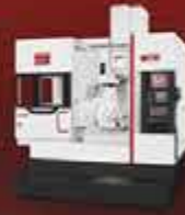
MF500 MF500U Full 5-Axis