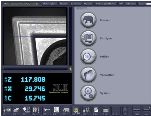
Picture 1: The new user interface for all ZOLLER machines with »pilot 3.0« software. User-friendly and intuitive operation.