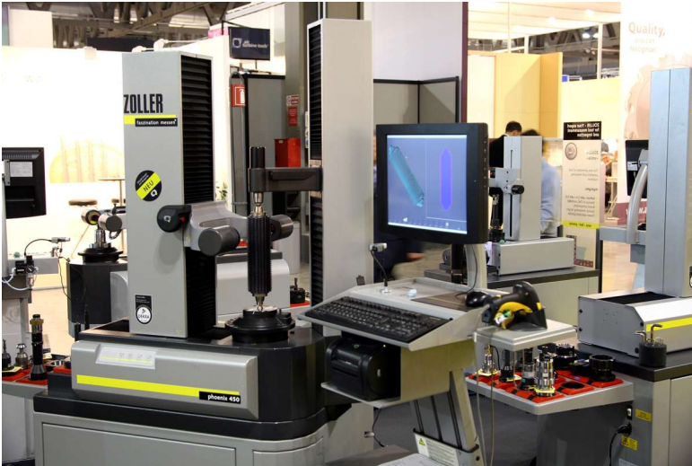
Picture 4: The ZOLLER »phoenix«: \mu -precise presetting and measuring of reamers.