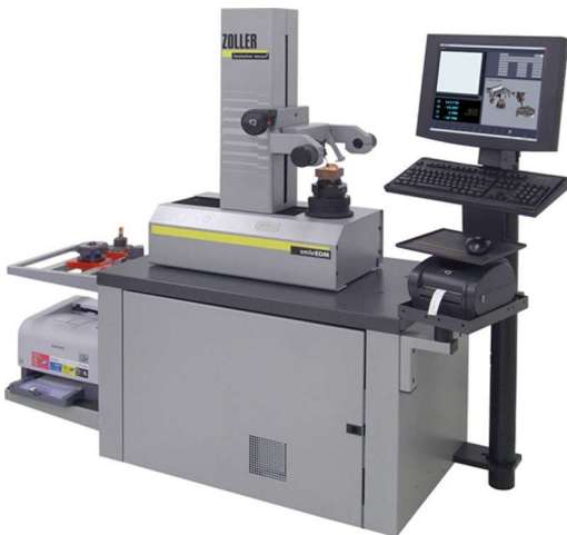
Picture 2: The ZOLLER »smile EDM«: Universal measuring of electrodes and tools.